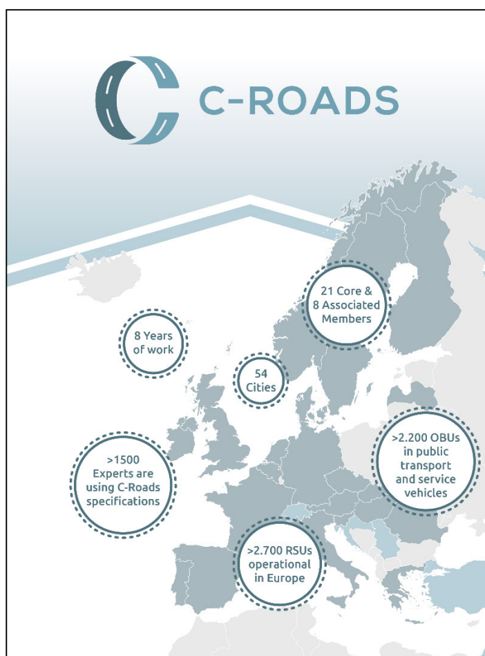
Figure Fehler! Kein Text mit angegebener Formatvorlage im Dokument.: Overview of C-Roads coverage